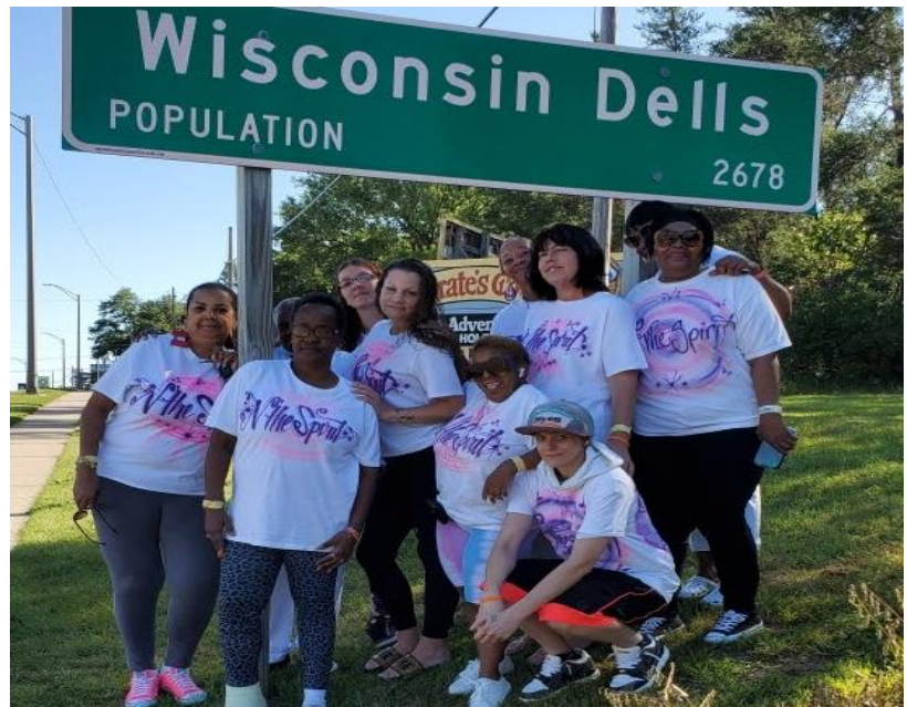
NTS at Wisconsin Dells 2021