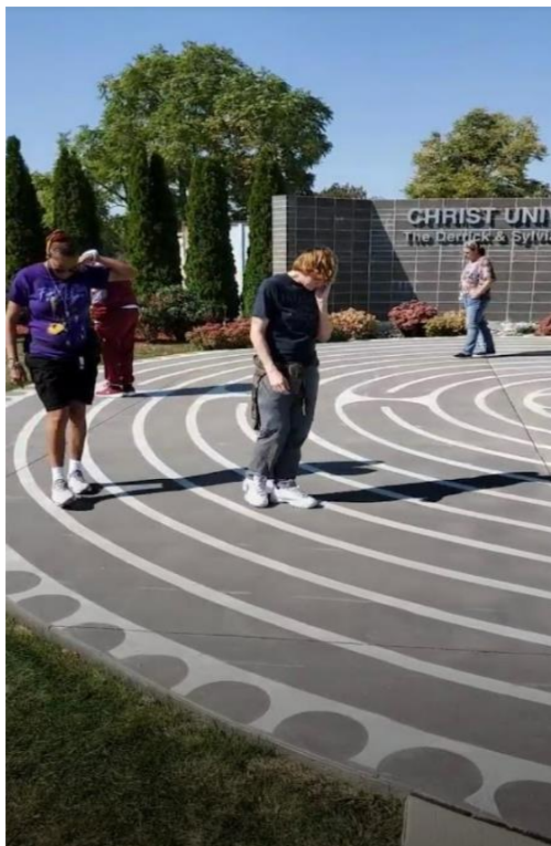
Spiritual Labyrinth Walk