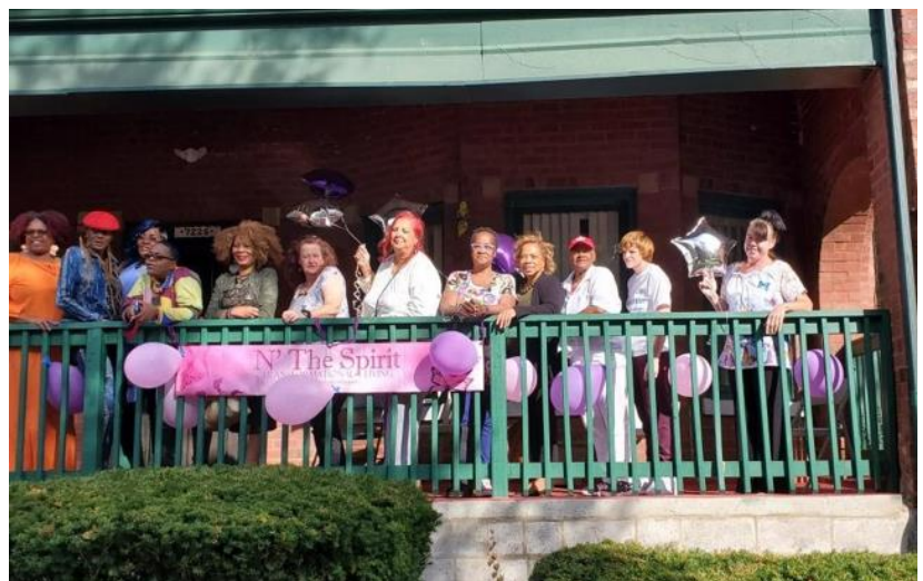
Alumni Picnic 2021